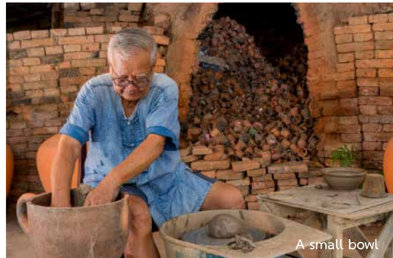
A small bowl

water. Holding it with wet cloth will help smoothen pottery, leaving no fingermark. This also makes it convenient to mold the clay as this slippery cloth helps reduce friction of clay and hand, hence, faster molding.