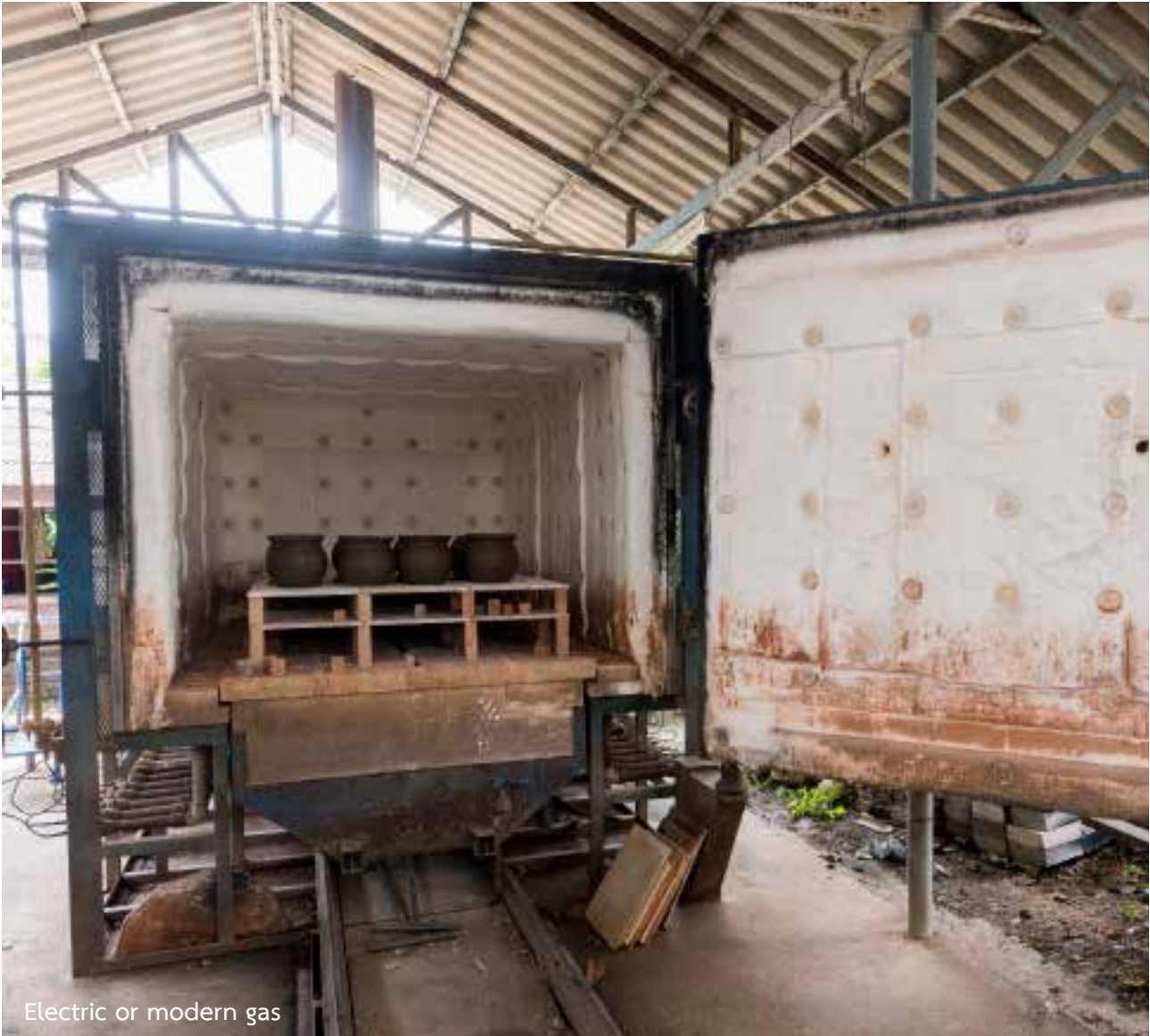
Electric or modern gas

Koh Kret Pottery was initially made of clay from a paddy field in Koh Kret area, had it mixed with river sand to enhance strength. The sand can be easily found along the Chao Phraya River. It was burnt in a kiln with a cover which is called by a villager as “Tao Lang Tao” [a turtle back kiln]. It is a kiln with a heat upward system. There is a window to put firewood in front. Firewood was brought from mixed forest and mangrove forest. At present, good quality clay become scarce. A potter has to order clay from nearby areas of Koh Kret and from Pathumthani province. Burning is not done in a kiln with a cover any more since it is broken and it is