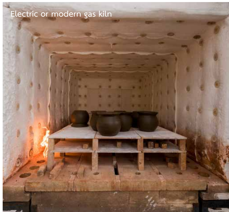
Electric or modern gas kiln