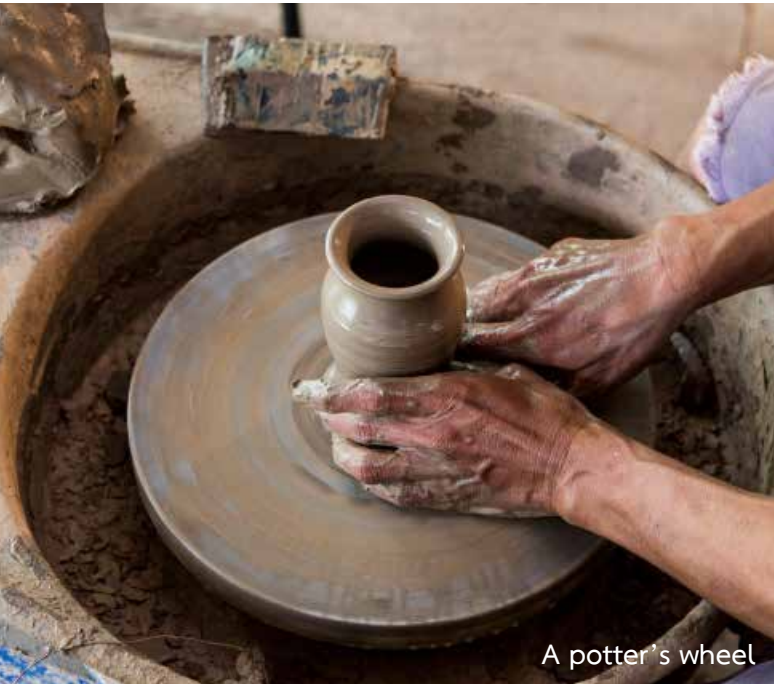
A potter's wheel

A potter's wheel is used to form a vase, a jar, etc. A wheel is made of a big piece of wood, which is adjusted into a semi-circle shape, like a top. The upper part is flat with a round-flat stick on top of it, like a flat top. A diameter of a wheel is 50-60 centimeters long. The lower part is cored into a round shape with a 10-centimeter long diameter, 30-40 centimeters deep.