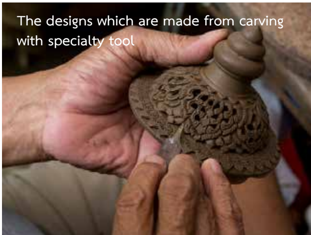
The designs which are made from carving with specialty tool

There are three main styles as follows: 1. The designs which are made from carving with specialty tool; 2. The designs which are made from perforating; 3. The designs which are made from embossing or debossing to create either raised or recessed relief images according to the designs.