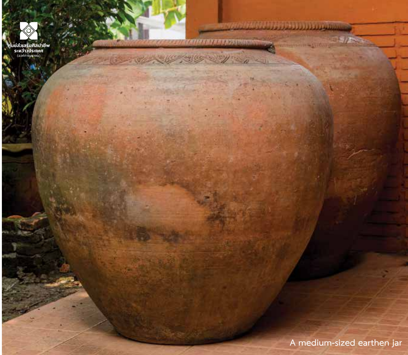
A medium-sized earthen jar

• A big earthen jar in an oval and high shape, with a broad shoulder and a broad mouth. The lower part is getting slightly narrow. Its bottom is flat. The mouth of the jar is bigger than the bottom. A big bowl is used to cover instead of a lid. There is no engraving. One jar can contain up to 10 buckets of water.